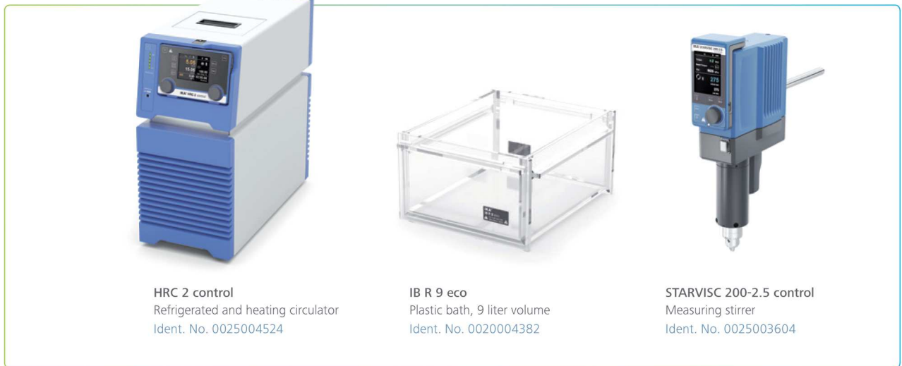
HRC 2 control Refrigerated and heating circulator Ident. No. 0025004524

If required, the following IKA devices are available for your lab to enhance viscosity measurements with your ROTAVISC: