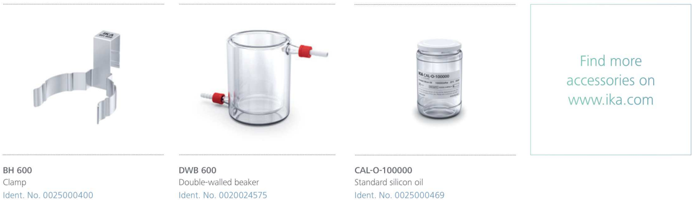
BH 600 Clamp Ident. No. 0025000400

The right accessory for each viscosity measurement: ranging from standard silicon oils to different adapters for various samples.